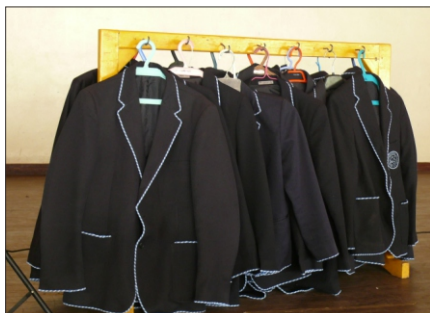
Prefects' blazers, braiding is attached on appointment. (Boys and Girls)