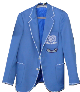
Honours blazer which is awarded to pupils for outstanding achievement. (Boys and Girls)

Please note - all items marked * will be available for purchase from the designated outfitter in January