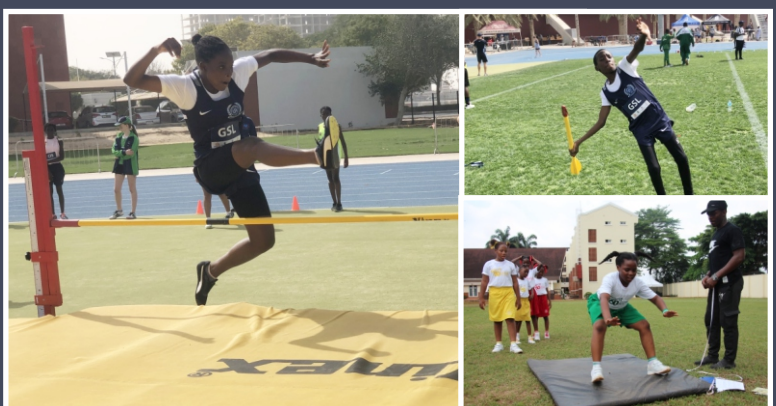
Track and Field