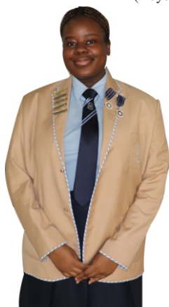
Honours blazer which is awarded to pupils for good conduct. (Boys and Girls)